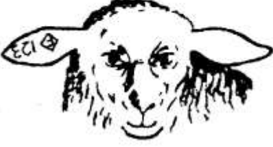
Rams and Ewes - Off (right) ear