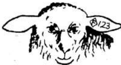
Rams and Ewes - Near (left) ear