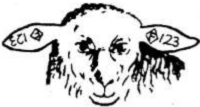
Rams - Off ear Ewes - Near ear