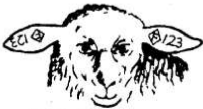
Rams - Near ear Ewes - Off ear