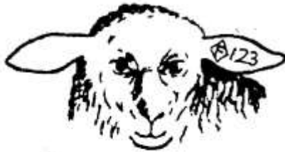
Rams and Ewes - Near (left) ear